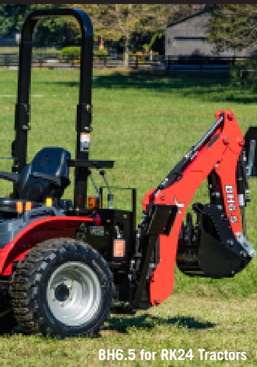
BH6.5 for RK24 Tractors