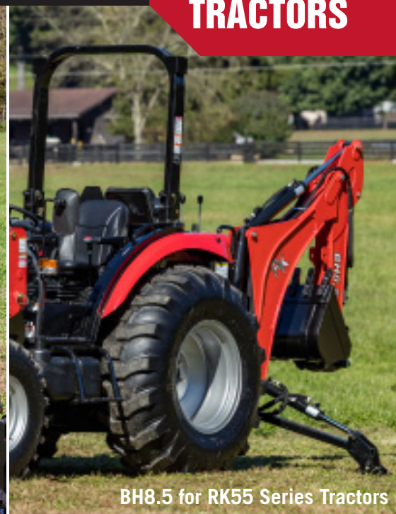
BH8.5 for RK55 Series Tractors

RK Tractors Backhoes are performance-matched with our RK24 (BH6.5), RK37 Series (BH7.5) and RK55 Series (BH8.5) tractors. All backhoes come complete with heavy-duty bucket, full sub-frame and mechanical thumb, all standard and included in the price. Additional bucket sizes are available as options for all models. The tractor operator seat pivots to the backhoe controls on the RK24/BH6.5, with an independent seat/operator station standard with the RK37/BH7.5 and RK55/BH8.5 models.