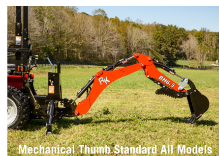
Mechanical Thumb Standard All Models