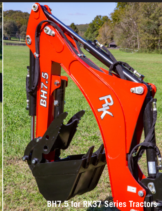
BH7.5 for RK37 Series Tractors