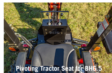
Pivoting Tractor Seat for BH6.5